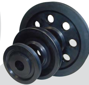
11-1/2", 15-3/8", and 22" OD sheaves are shown above.

TECAST VEKTON sheaves combine excellent "built-in" lubricity with high impact resistance and cost less than steel sheaves because minimal machining is needed to accommodate bearings. In addition, since the wire rope service life is increased and lubrication is not required after the initial application, maintenance costs are dramatically reduced. All TECAST VEKTON sheaves can be supplied with roller bearings, bronze sleeves, or with a plain bore. Grease fittings and lubrication passages can be added, as needed.