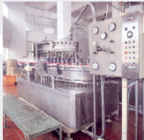
Material Replaced: PET

HYDEX® 4101 was selected for its improved impact resistance, which enabled it to withstand the punching process without breaking or cracking. Another reason Hydex® 4101 was utilized for this part is its excellent chemical resistance, particularly to cleaning chemicals, which are characteristically used in a food processing environment.